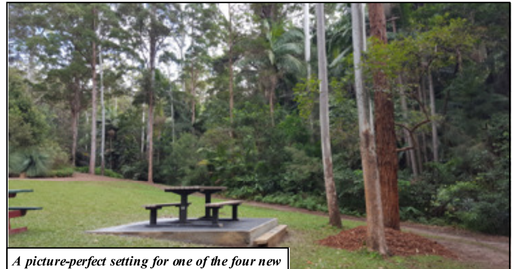
A picture-perfect setting for one of the four new picnic settings purchased from grant funding.

This Botanic Gardens feature has seen some changes since it began as a Cherry Tree Walk in 2002. Unfortunately the Cherry Trees, which were a gift from the Gifu prefecture in Japan suffered badly from our sub tropical climate, borers and fungus and were not the success hoped for. Several years ago it was decided to inter-plant with a white flowering "India Summer" Crepe myrtle, Lagerstroemia natchez . They powered ahead and are magnificent. They are now a feature both during their flowering period and in late autumn and winter when they colour up in all their glory. These months are a special time for visitors who flock to our Gardens to see autumn colour, not usually common in South East Queensland. With the beautiful herringbone patterned pavers laid 8 years ago, the newly tiled Rotunda and the magnificent Crepe myrtle avenue, the Volunteers can be well pleased.