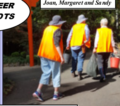
The morning tea break is over and it's back to work for our volunteers!